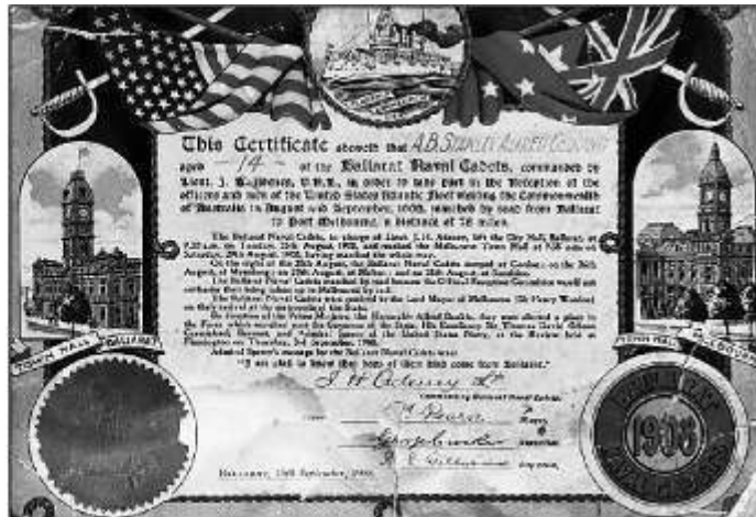
RECOGNITION: A copy of the certificate given to each of the Ballarat naval cadets who took part in the three-day march.