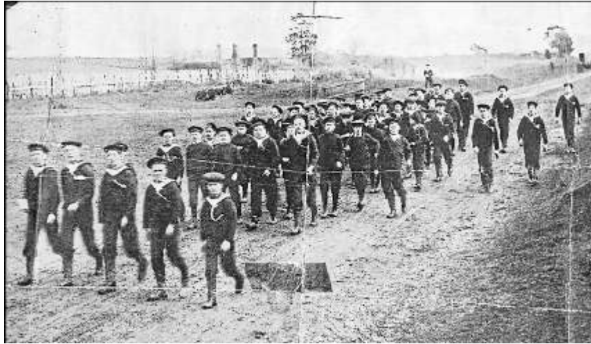
ON THE ROAD: The cadets during their three-day march