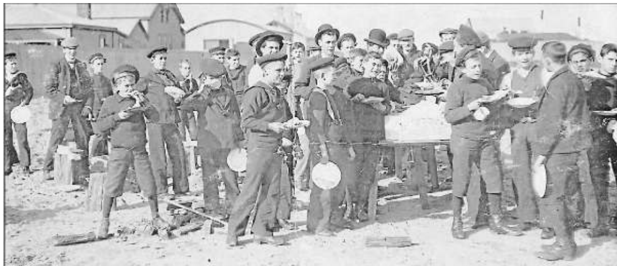
MEAL BREAK: A group of Ballarat naval cadets line up for a meal during their historic march to Melbourne in August 1908.