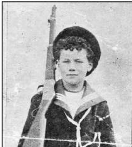
READY TO GO: One of the young cadets who took part in the march.